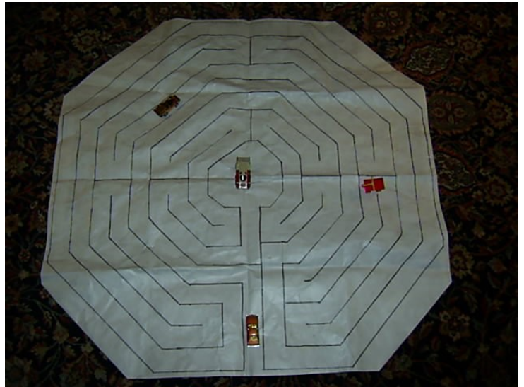
Octagonal table labyrinth

This labyrinth is useful in that it is easily folded up and transported, and as such very easily walked in small rooms. Its path design is in the medieval style and was derived from the "Ceremonial 4" design found on labyrinthcompany.com .