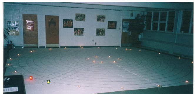
R-QM Chartres labyrinth, with candles set in the lunations and rosettes

Time to walk the labyrinth: 20 to 40 minutes