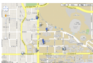
FUDCon Tempe 2011 - Google Map